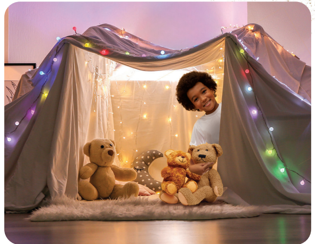
Blanket fort building