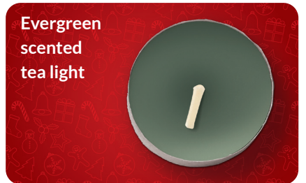
Evergreen scented tea light