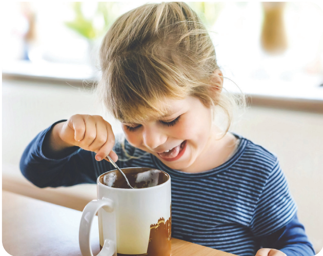
Hot chocolate progressive treasure hunt

Creative activities help to reinforce each teaching point and provide some fun family bonding time too!