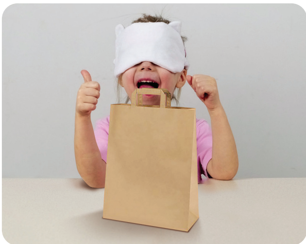
Can you guess the evergreen smell?