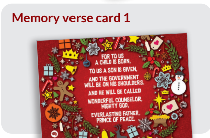
Memory verse card 1