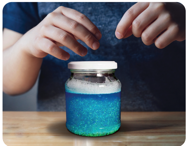
Calm down jar