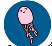
8. Eight glowing jellyfish