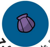
7. Seven purple seashells