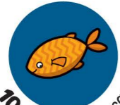
10. Ten stripy orange fish