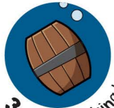
3. Three sinking barrels