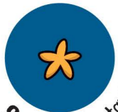
9. Nine little starfish