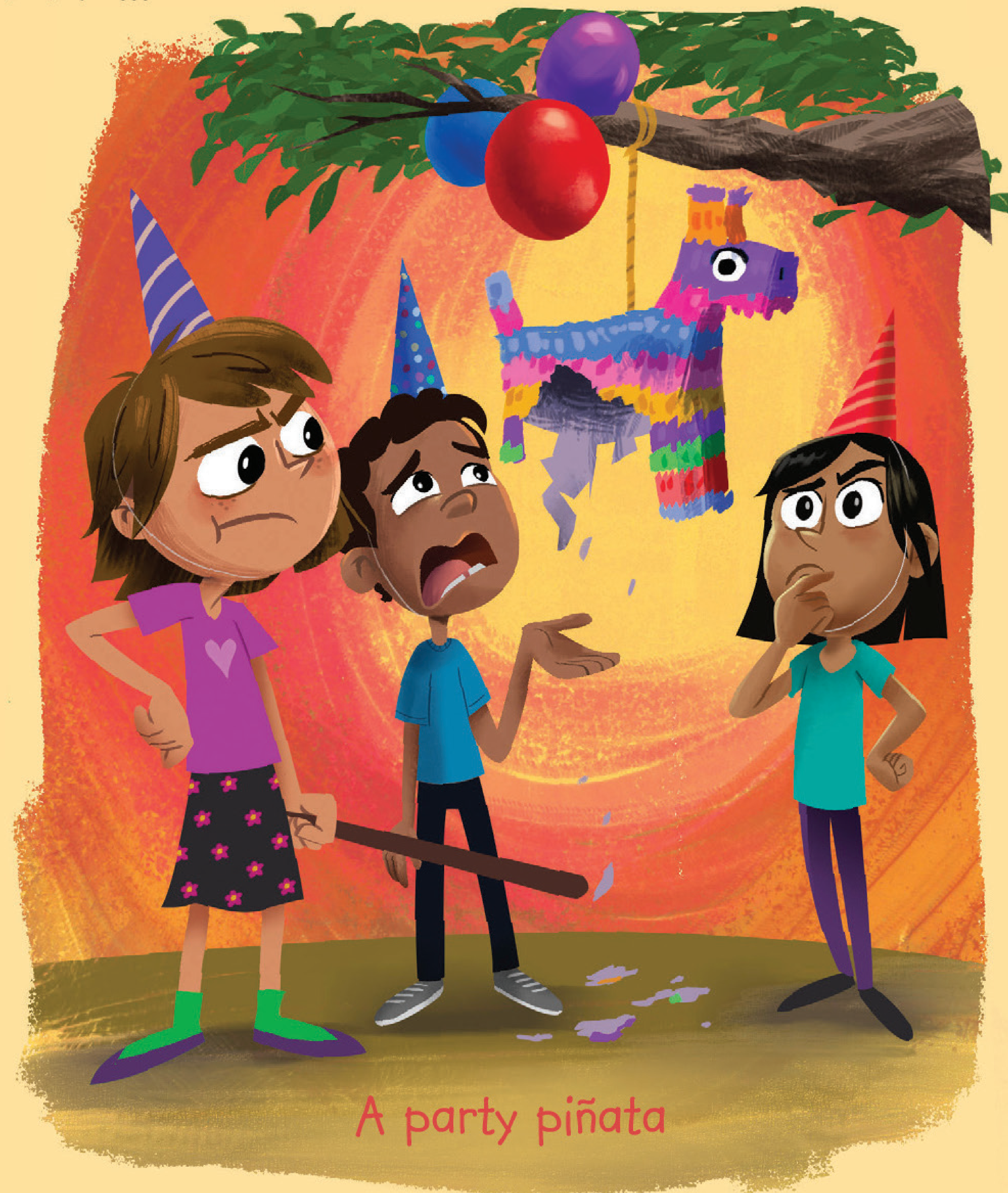
A party piñata