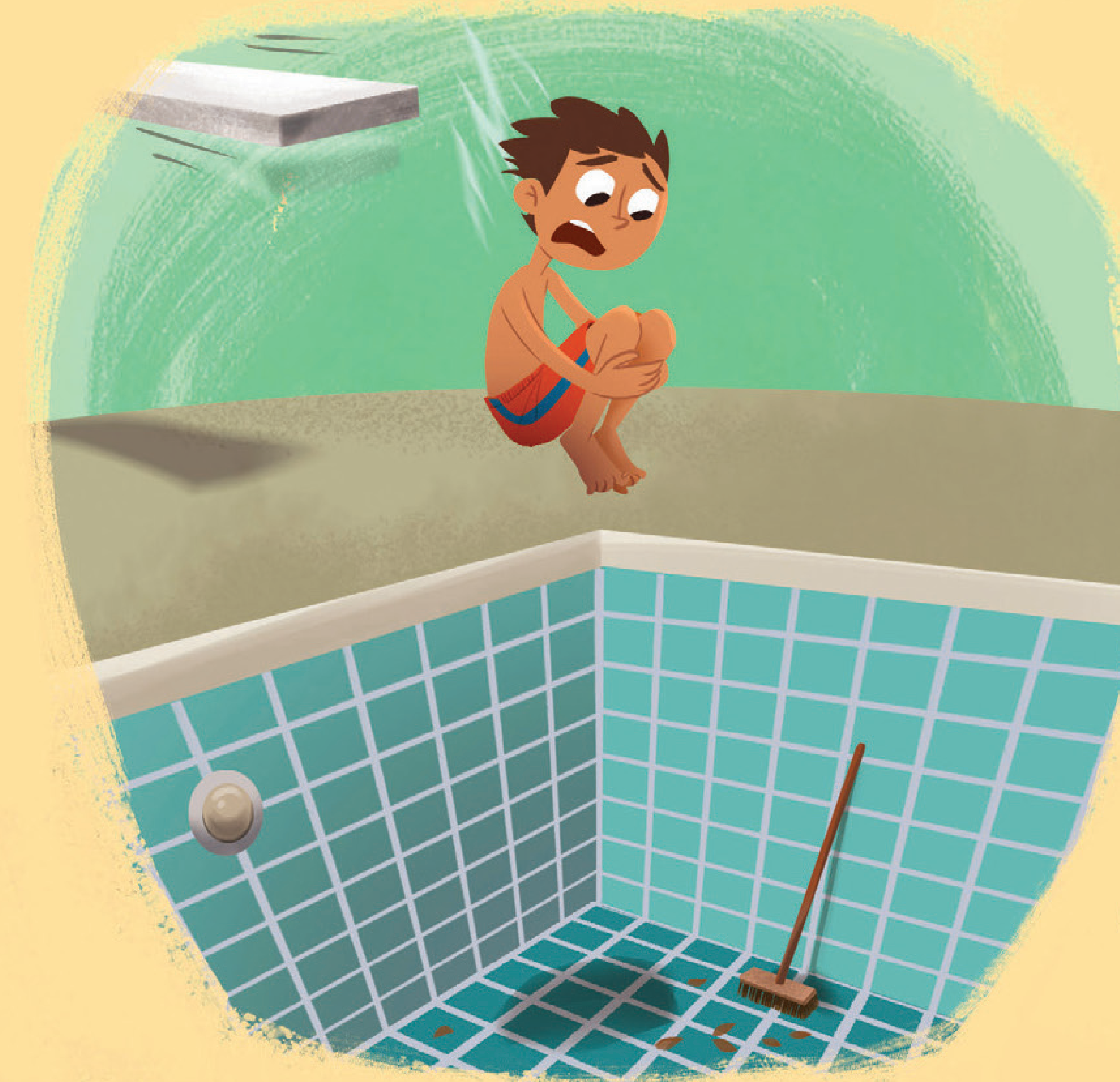
A swimming pool Uh-oh. This is gonna hurt ...